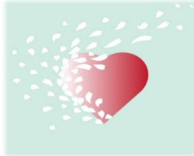
Winds of Change