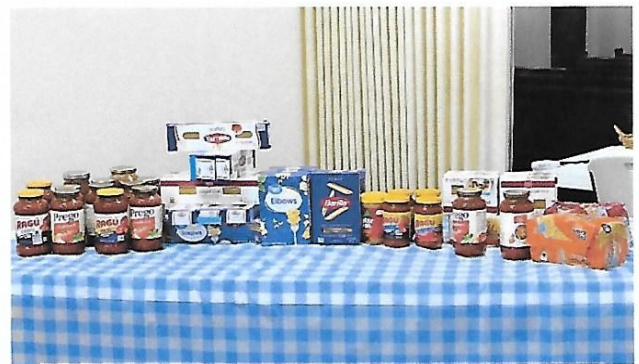
Hands-on Mission: Food Pantry Items