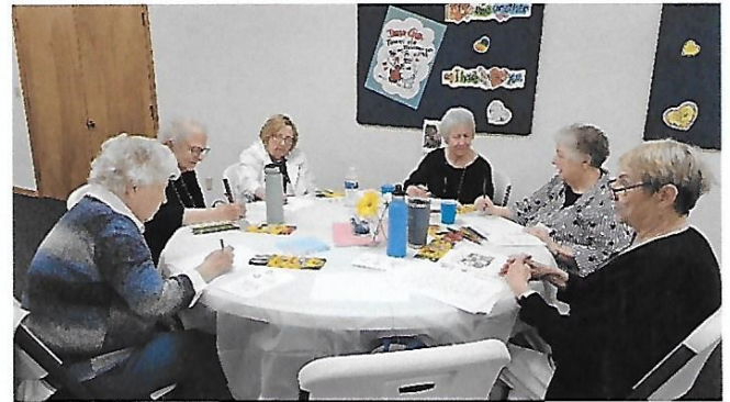
Pray & Color