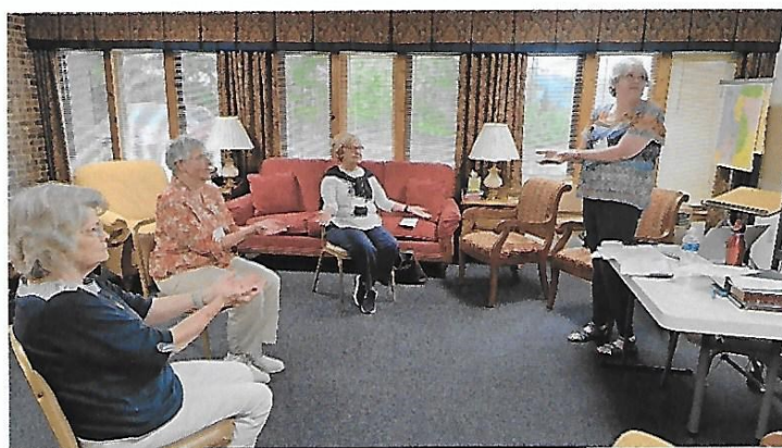
My Body in Prayer