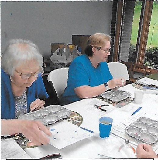
Make & Take Prayer Beads