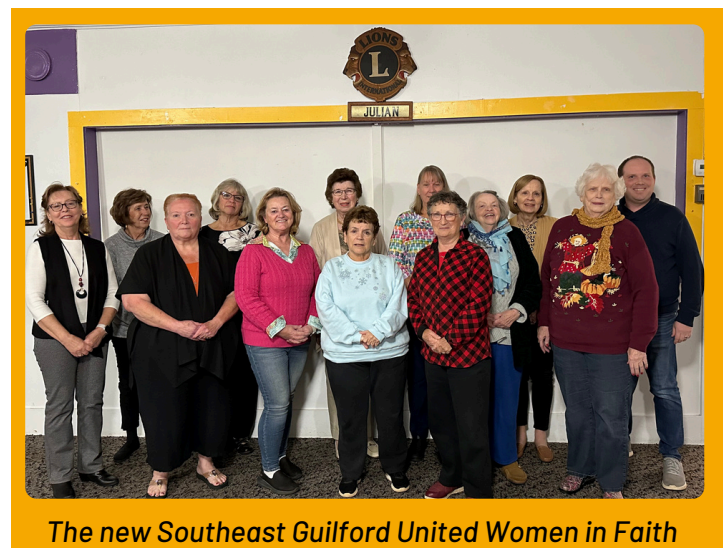
The new Southeast Guilford United Women in Faith

No, this is not old history. This is new history in the making.