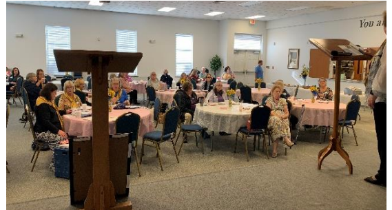
Uwharrie District Leaders