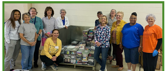
The Uwharrie District Team living out the meaning of ubuntu at the Mission Response Center for an Ubuntu Day of Service on October 7, 2023

Ubuntu is the meaning of mission. We find creative ways to come together and put love in action. Each time we participate in Ubuntu Days, it is inspirational and life-giving. We are blessed by serving others, sharing our faith through United Women in Faith, and making hope a reality by making a difference in the lives of women, children, and youth. May all United Women in Faith continue to see God's hand at work and be God's hands at work!