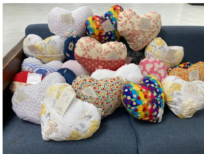
First batch of Providence's Heart Pillows