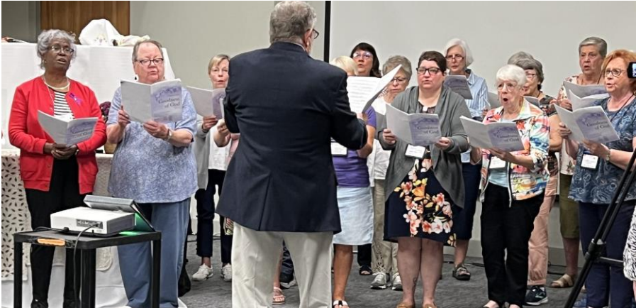
The Choir at Annual Celebration 2023