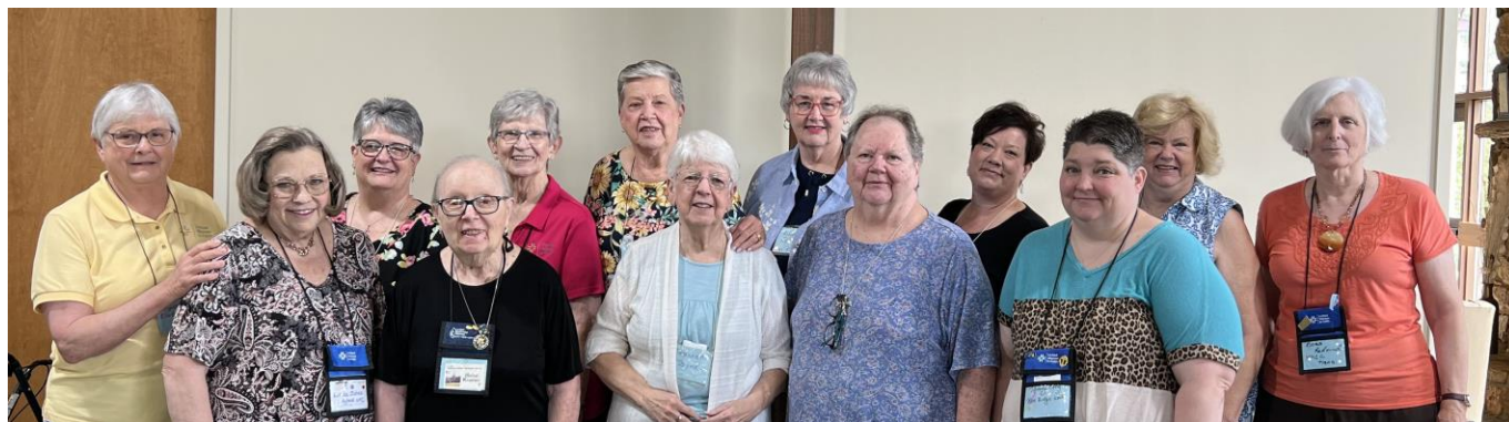
Blue Ridge District Unit at Mission U