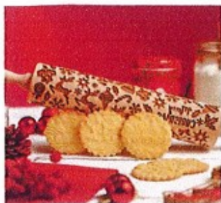
SANTA CLAUS ROLLING PIN $23.48