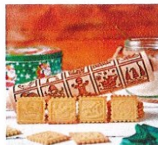
JOYEUX NOËL ROLLING PIN $23.48