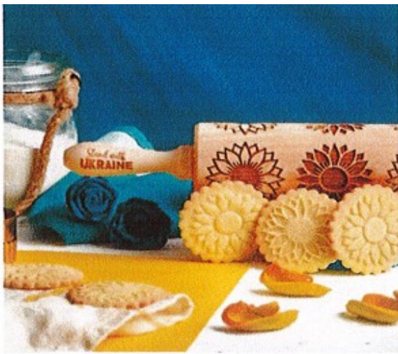
STAND WITH UKRAINE ROLLING PIN (LIMITED EDITION) $26.69