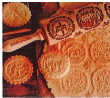
NATIVITY ROLLING PIN $23.48