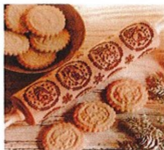
SECRET SANTA ROLLING PIN $23.48