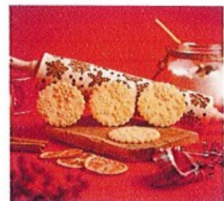
SNOW ROLLING PIN $23.48