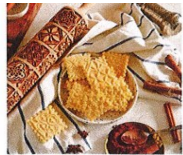
VINTAGE ROLLING PIN $23.48