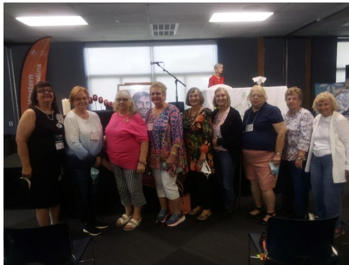
Uwharrie Team at Annual Celebration Conference