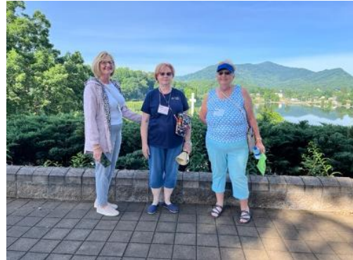
Touring the Gardens, Spiritual Growth Retreat, Lake Junaluska