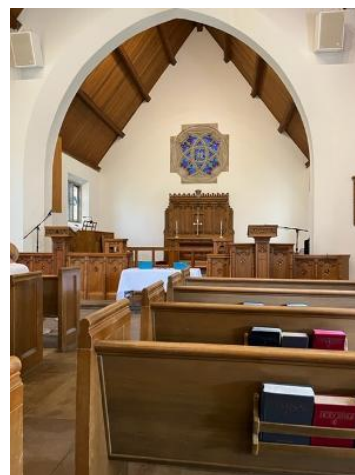
Chapel at Lake Junaluska