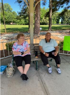
Mission Walk Grimes Park