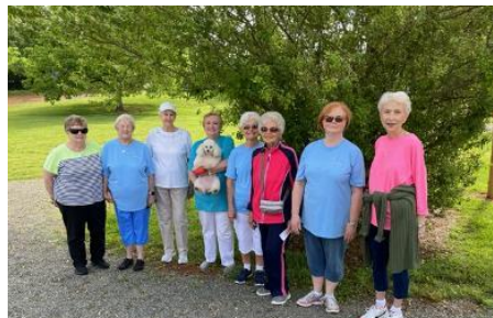
Walk for Missions, Central Denton