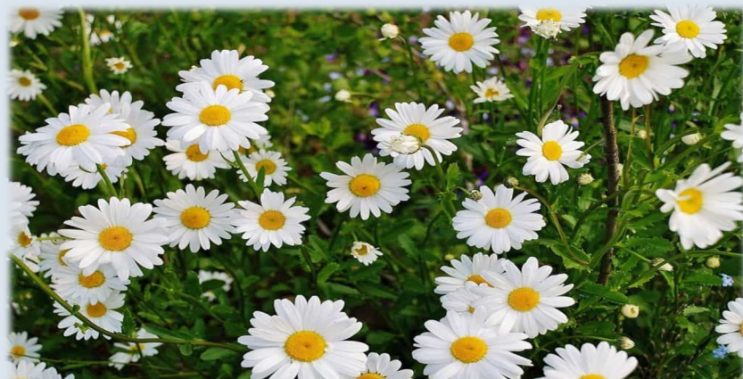
Sunshine On A Stem