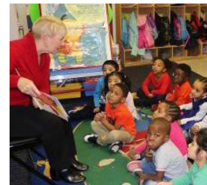
UMW Bethlehem Centers