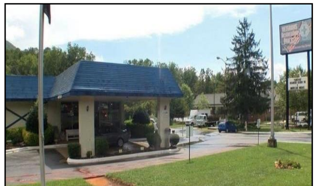
ABCCM Veterans Restoration Quarter