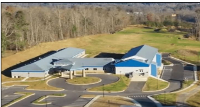
ABCCM Transformation Village

Donations and supplies were collected for Asheville Buncombe Christian Community Ministry’s two shelters: Veterans Restoration Quarters (housing veterans aged 60+ years) and Transformation Village (housing women veterans and women with children).