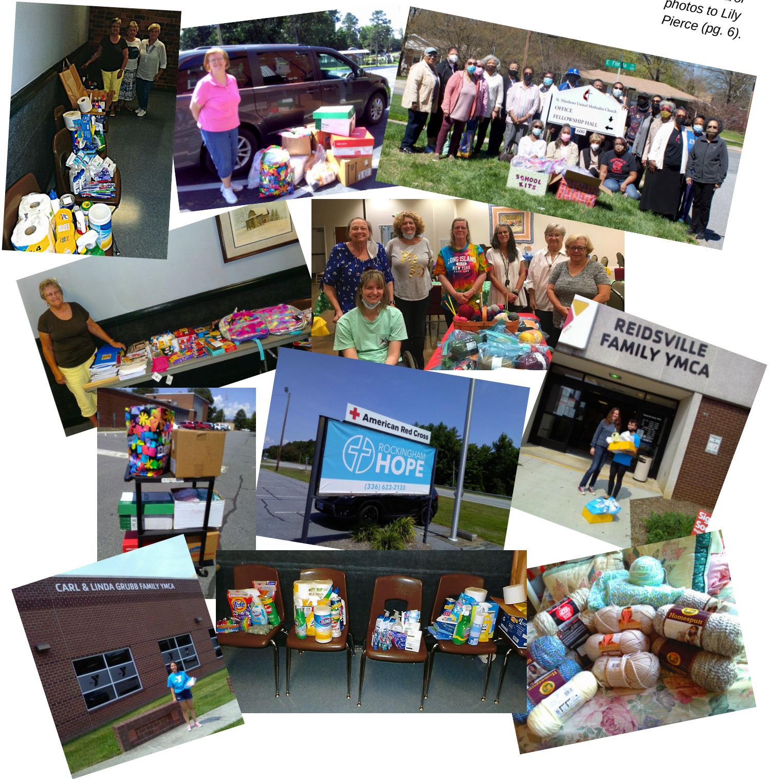
On the left of the 1st and 2nd rows, Archdale UMW ladies pose with items for Carl & Linda Grubb YMCA and Leslie's House. In the middle of the first row, a Hinshaw UMW member poses with sewing materials collected by her unit. In the upper right corner, St. Matthews UMW members pose with school kits for the Hayes Taylor YMCA. To the right on the 2nd row, Gideon Grove UMW members pose with sewing materials collected by their unit. All other pictures show items donated by other units and delivered to "Step Up & Reach Out" locations.