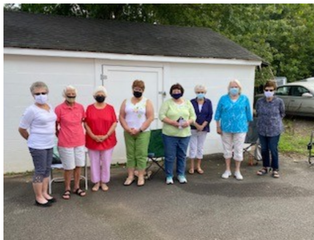
Shout out to Sharon's UMW for a wonderful meeting. It was beautiful outside and we learned a lot together.

For much more information, go to unitedmethodistwomen.org .