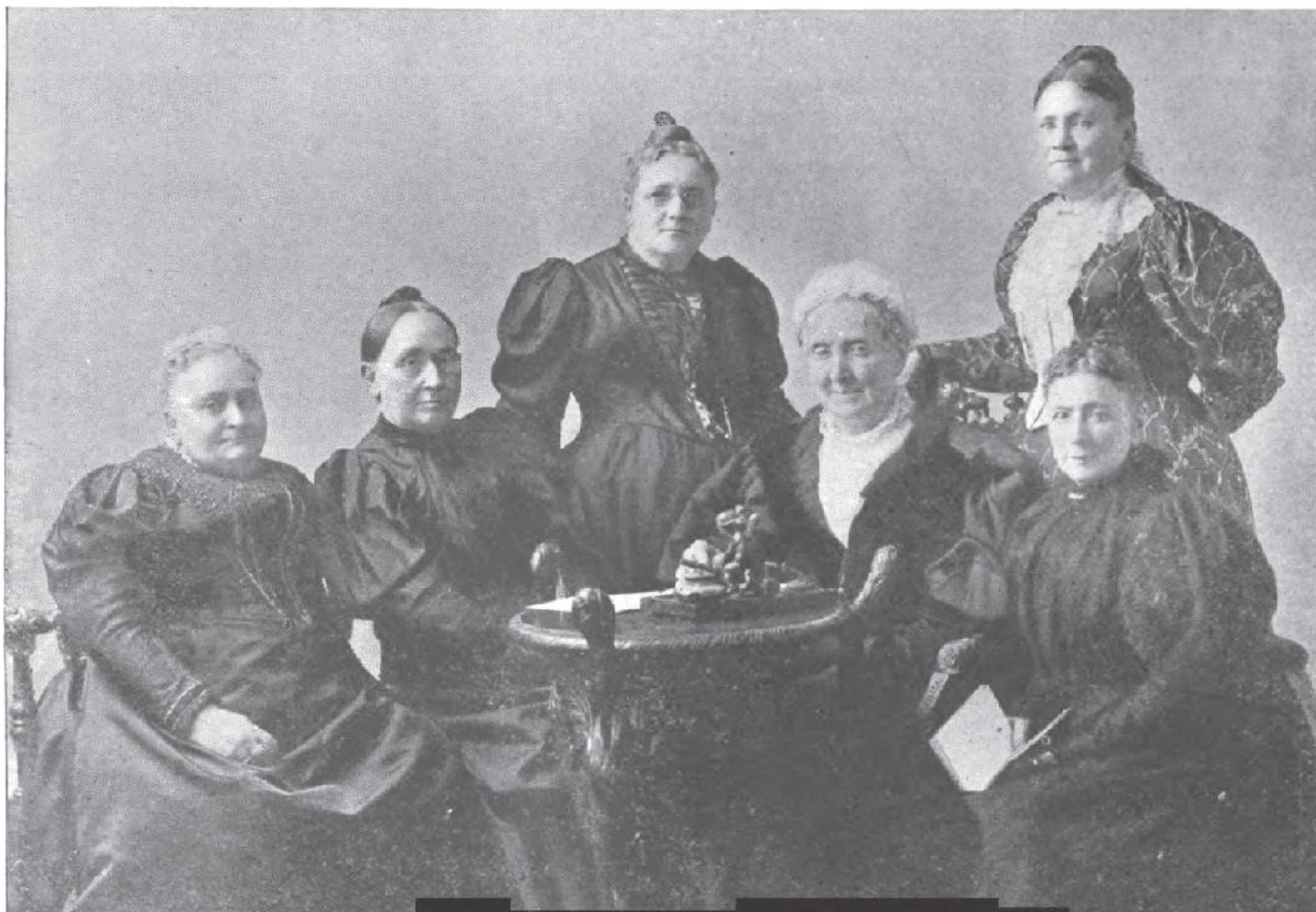
FOUNDERS OF THE WOMAN'S FOREIGN MISSIONARY SOCIETY (TAKEN 1895)

The organized unit of United Methodist Women shall be a community of women whose purpose is to know God; to experience freedom as whole persons through Jesus Christ; to develop a creative, supportive fellowship; and to expand concepts of mission through participation in the global ministries of the church.