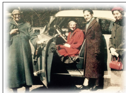
The first four women residents.