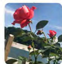
Thorns & Roses