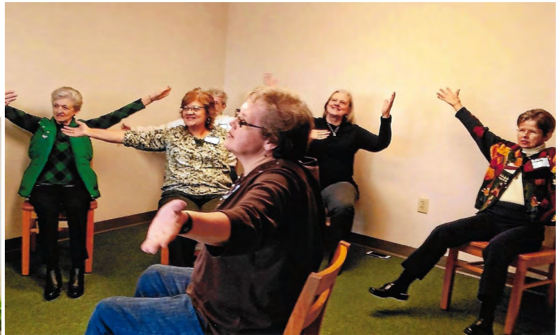
◀ We filled many boxes with hygiene & school kits for UMCOR’s Disaster Response group.