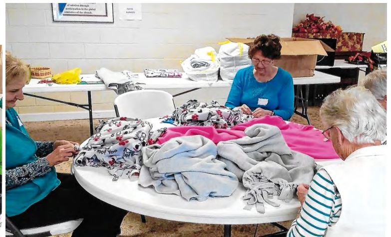
◀ Making fleece blankets for children in Foster Care.