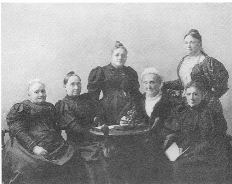
THE FOUNDERS OF THE WOMAN'S FOREIGN MISSIONARY SOCIETY (Taken fifteen years after the organization, when two of the original eight could not be found.)