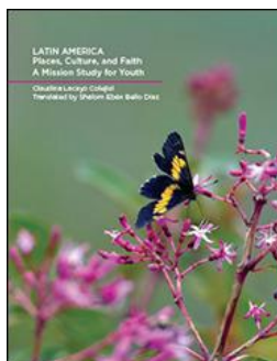
Youth Study Latin America: Places, Culture, and Faith (Stock# M3227)