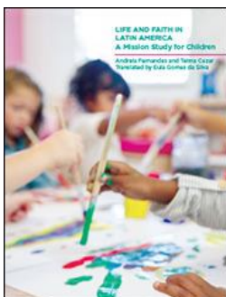
Children’s Study Life and Faith In Latin America (Stock# M3226)

Free Study Leader Guides – available for download from UMW Mission Resources