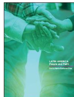
Geographic Study Latin America (Stock# M3223)