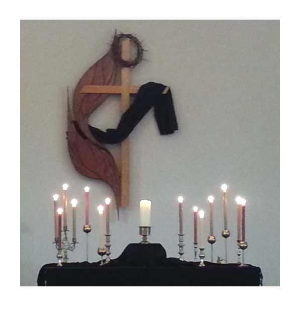
The Altar from the Good Friday Tennebrae Service